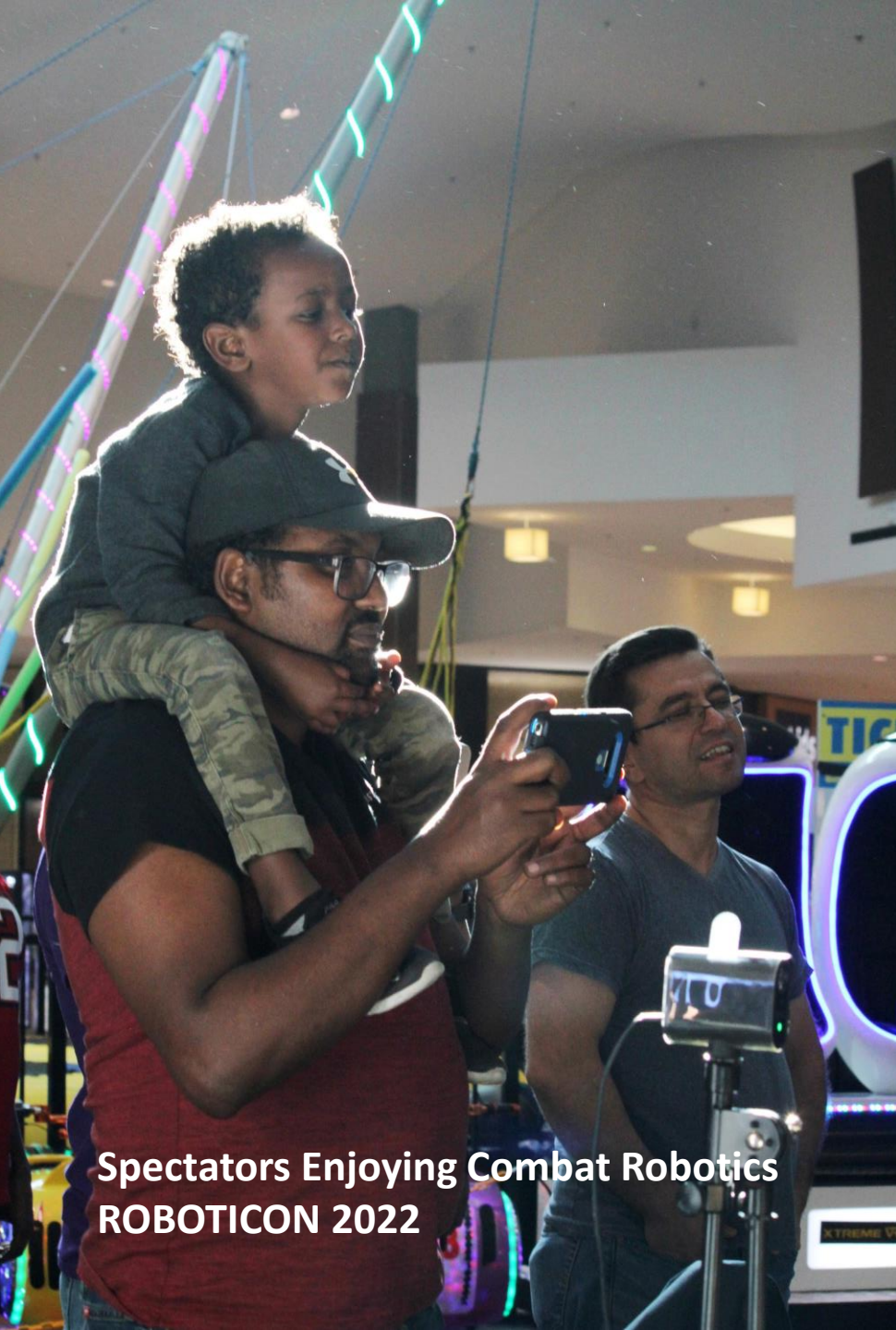
Spectators Enjoying Combat Robotics ROBOTICON 2022