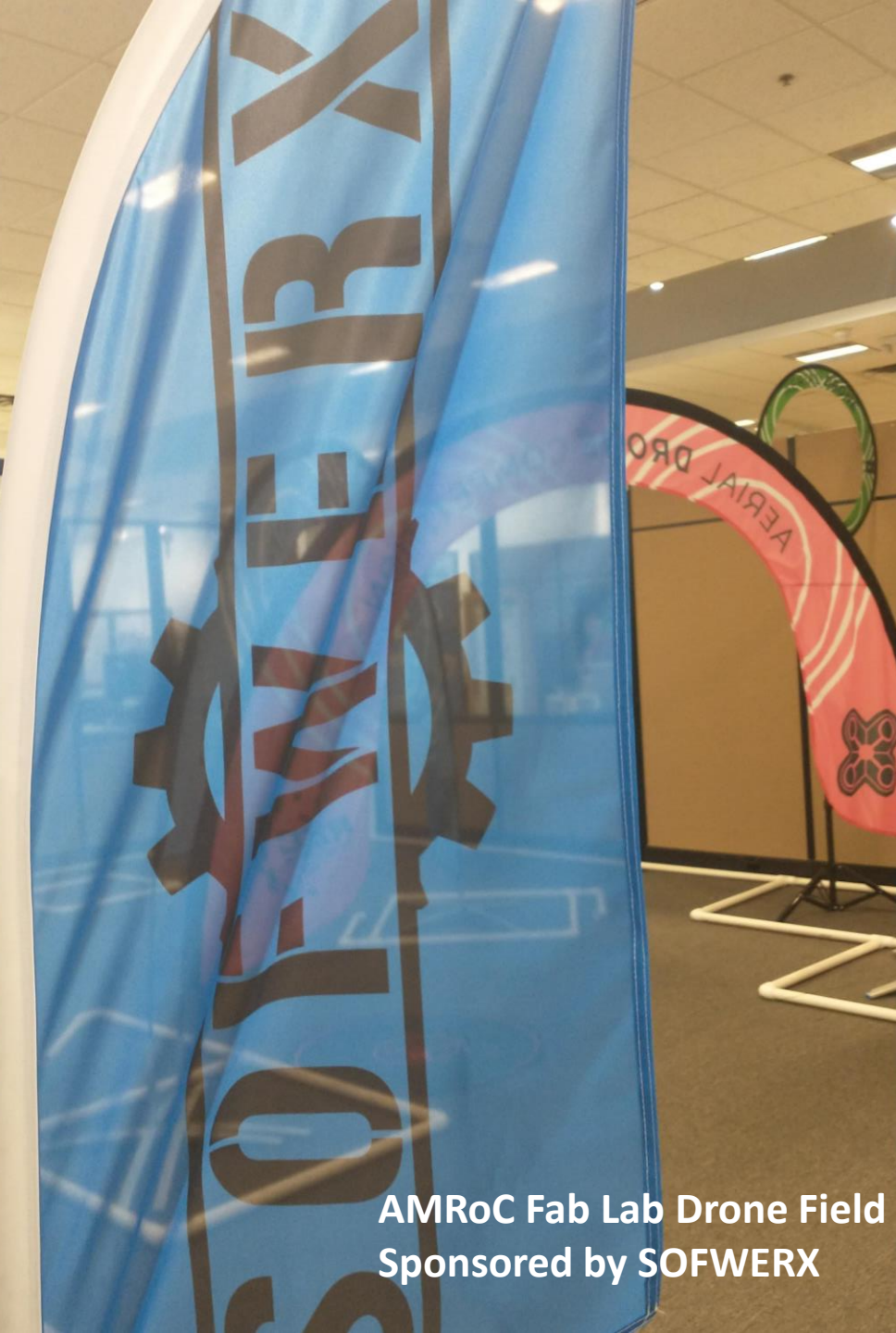
AMRoC Fab Lab Drone Field Sponsored by SOFWERX